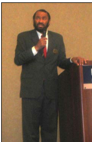
Congressman Al Green

“The world is not always fair, but God is always faithful - Congress- man Al Green